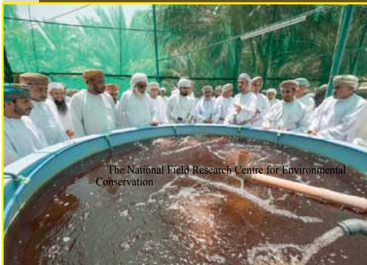
The National Field Research Centre for Environmental Conservation