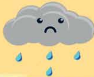
Scarcity of rainfall