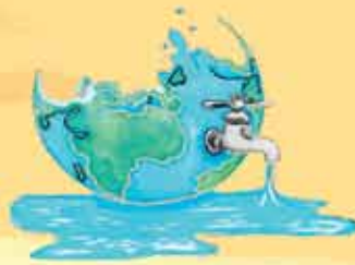
Over- pumping of water