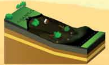
Soil erosion due to storms and cyclones