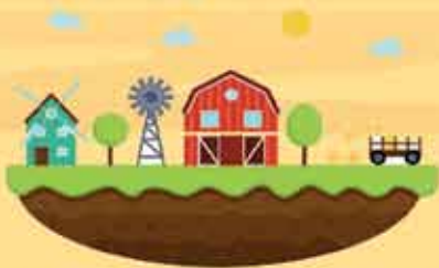
Use of traditional types of farming